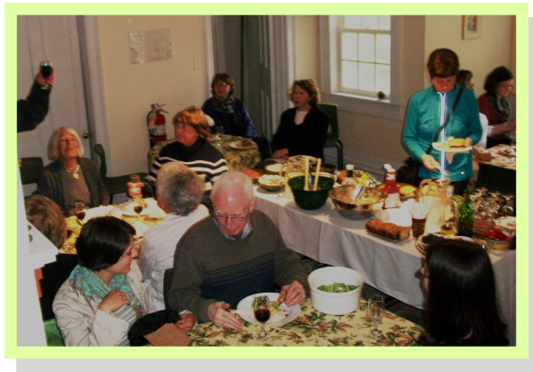
A snapshot from our Volunteer Barbeque, that was held to show our appreciation for the wonderful help from everyone who made this past year so successful!