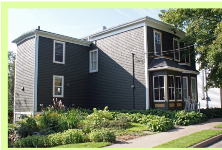
46 Tulip Street was featured in the 2009 House Heritage Tours

"We shape our dwellings and afterwards our dwellings shape us." – Winston Churchill.