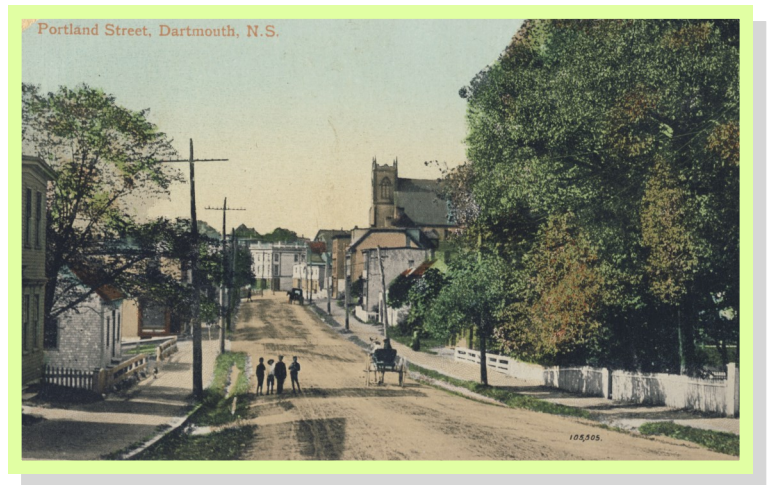
Postcard of Portland Street. (Date unknown)