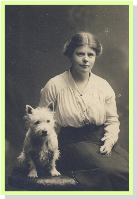
Postcard from the past.