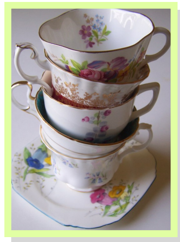
Fine china tea cups donated by Members await visitors