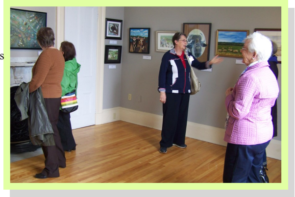
At the opening of the DVAS art show