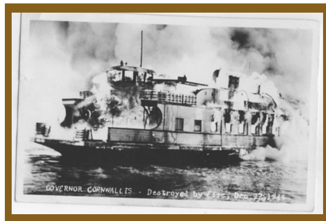
Postcard, titled "Governor Cornwallis - Destroyed by Fire, Dec. 22, 1944." DHM 2011.109.1