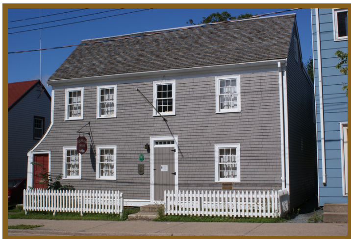
Above: Quaker House, 57 Ochterloney St

So, on Christmas Day, many other community shops and businesses would close, while Quakers continued to do business and work as usual. This, however, lead to legal and social repercussions as the surrounding mainly Christian population recognized Christmas Day as a day when business should not be done. Over time, some Quaker