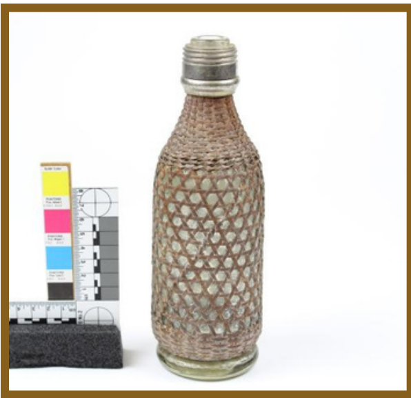
Above: DHM 2019.1.18

As many of our readers may know, the Dartmouth Heritage Museum collection is home to some 40,000 artefacts – including photos and archival materials. Within this vast collection, there are always little mysteries to be solved. The mystery I am addressing here refers to a bottle in our collection, accession number DHM 2019.1.18