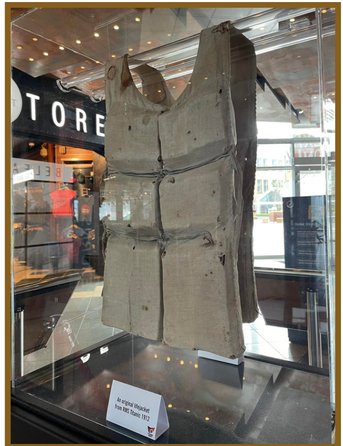
Above: Photo of the lifejacket on display at the Titanic Belfast Museum, from the Belfast Titanic Society Facebook Page.

While the Dartmouth Heritage Museum was only a brief part of the life and journey of this fascinating artifact, we are very pleased to know that it has emerged to be on display for the public to view!