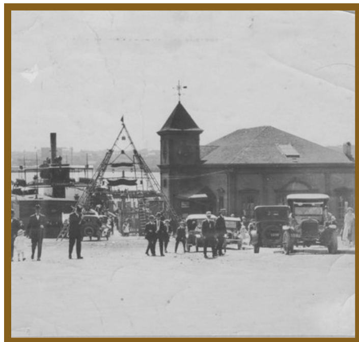
Above: Dartmouth Ferry Terminal in 1920, DHM 94.9.207

newly-formed Halifax and Dartmouth Steam Ferry Company, Ltd. This new company promised better service and two new steam ferries. By 1890, however, locals were furious with the company: it only built one ferry, overall service was poor and slow, and the popular nine-dollar quarterly family pass had been replaced with individual five-cent fares. Citizens voted unanimously to ask the Legislature for a $110,000 loan to start a public ferry service. The Legislature passed this act on 15 April 1890. The Dartmouth Ferry Committee was established on 23 April. The resulting citizens' boycott forced the Halifax and Dartmouth Steam Ferry Company to sell everything to the Dartmouth Ferry Commission for a total of $110,000.