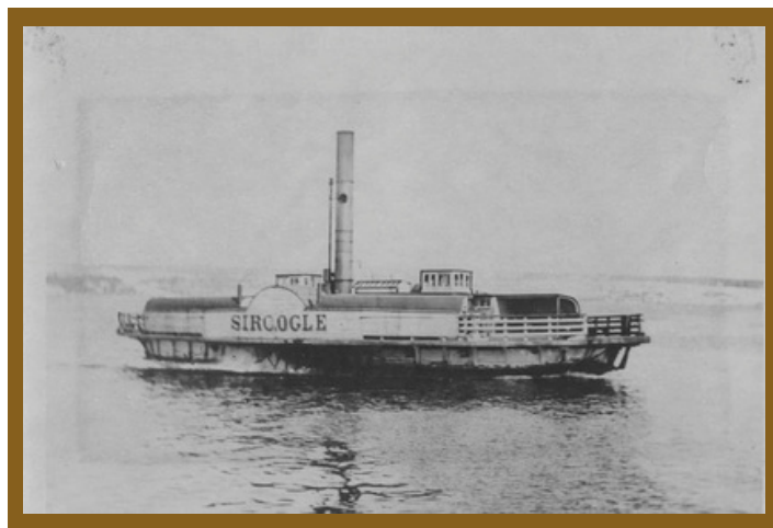
Above: Sir Ogle Ferry , DHM 1969.11.1

The Steam Boat Company's charter expired in 1866 and was renewed in 1867. In 1886, though, the company decided to sell its assets to the