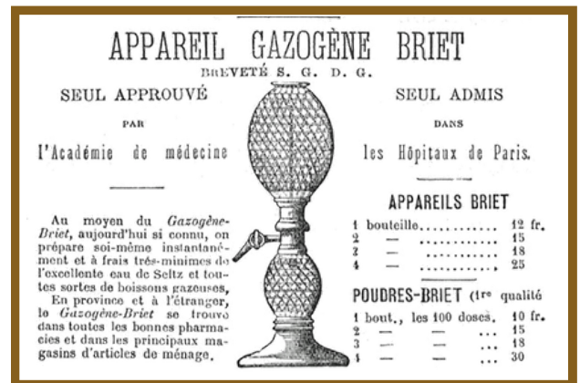
Above: Victorian Gasogene Illustration